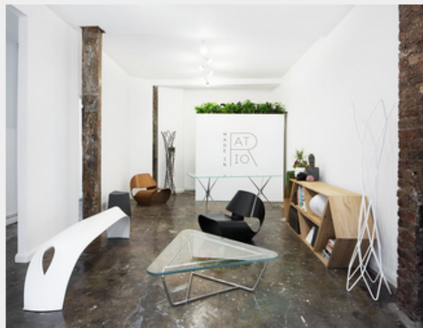
— In Ratio Showroom