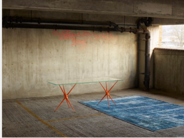
— Supernova table