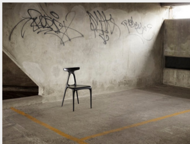
— Alpha Chair, Made in Ratio, 2015