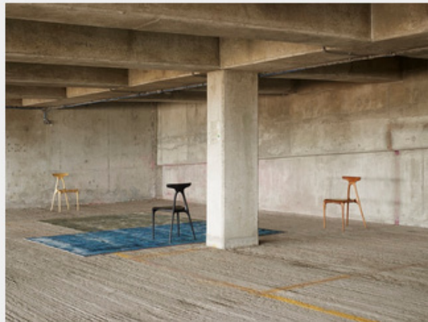
— Made in Ratio studio, London