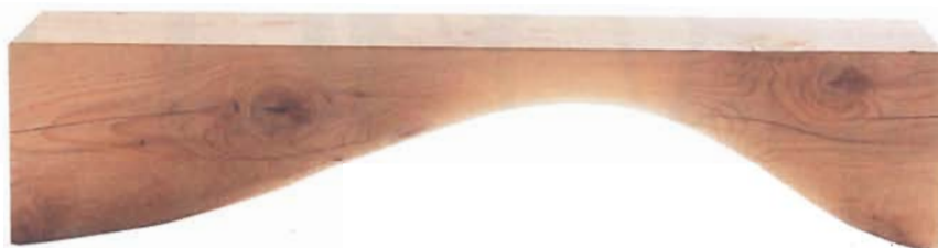
RIVA 1920 2012 CURVE, PANCA IN LEGNO DI CEDRO. CURVE BENCH IN CEDAR WOOD.