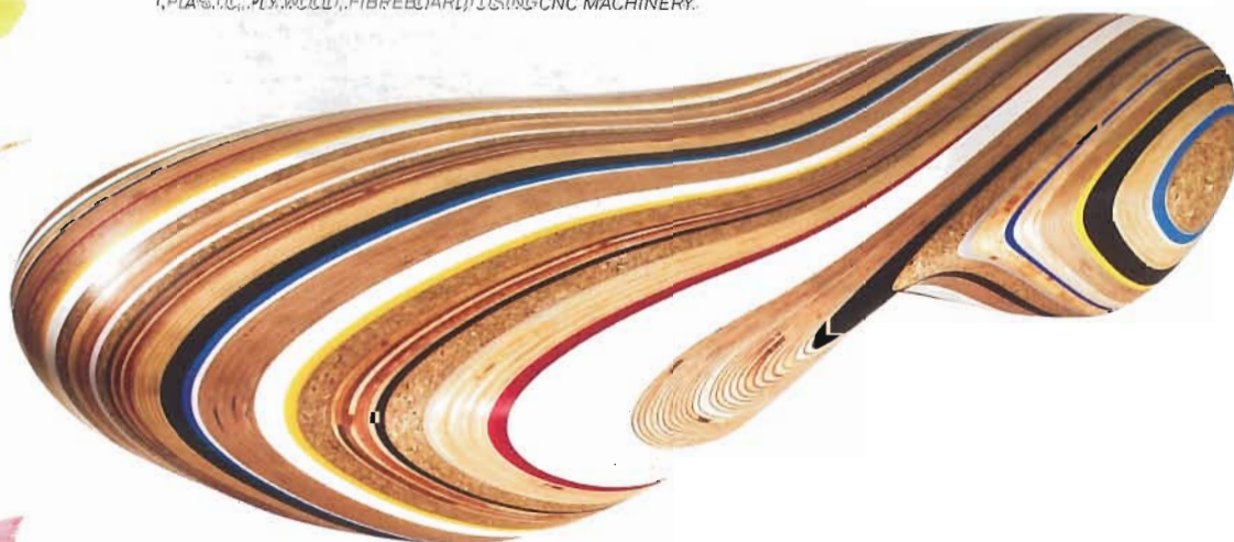
THE APARTMENT GALLERY 2008 REMIX CHAISE LONGUE, REALIZZATA CON UN MIX DI MATERIALI ETEROGENEI (PLASTICA, PLYWOOD, FIBREBOARD) USANDO MACCHINE CNC. REMIX CHAISE LONGUE MADE WITH A MIXTURE OF DIFFERENT MATERIALS (PLASTIC, PLYWOOD, FIBREBOARD) USING CNC MACHINERY.

NATO A / BORN IN Tasmania, Australia, 1979.