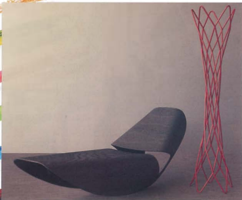
MADE IN RATIO 2013 COWRIE ROCKER, CHAISELONGUE DI PLYWOOD LAMINATO CON IMPIALLACCIATURA IN FRASSINO EBANIZZATO. MATRIX, APPENDIABILI IN ACCIAIO. COWRIE ROCKER, CHAISE LONGUE IN PLYWOOD LAMINATED WITH EBONIZED ASH VENEER. MATRIX, STEEL COAT RACK.